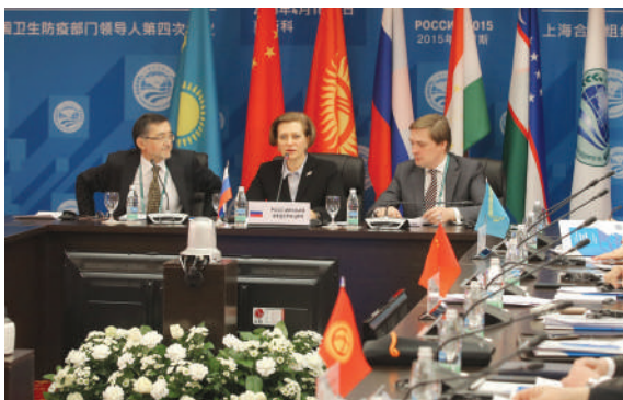
State and international forums and summits

FOR WHICH PROXY CENTRE PROVIDES A FULL RANGE OF EVENT ORGANIZATION SERVICES: