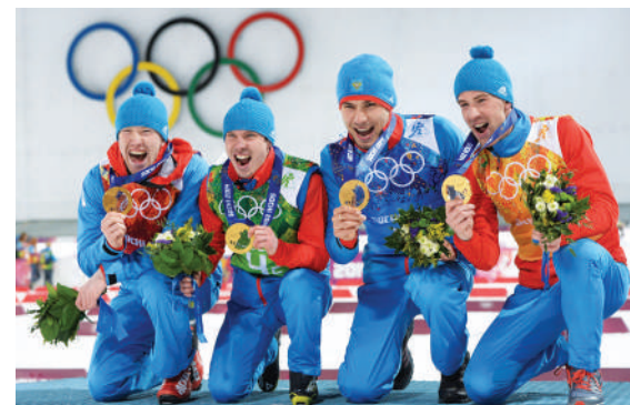
Athletic events of the state and international level