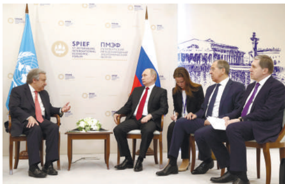
Conferences and seminars held by the largest Russian and international companies